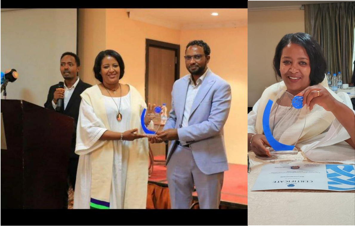
Picture1: National Award Recognition of of Ministry of Health

including Ethio-Telecom, Ministry of Women and Social Affairs, Ministry of Health, Ministry of Education, Ministry of National Defense Force, Addis Ababa Finance office, and Subsequent regional offices, we also have strengthened our existing collaborations with networks including the Ethiopian Federation for persons with disability, Ethiopian Center for Disability and Development, Cheshire Ethiopia, UNICEF, GIDABO Policy Center, Members of Autism Society of Ethiopia, Network of Ethiopian Women Associations, CORHA, and Orbit Technology Solutions, others on different partnership initiatives.